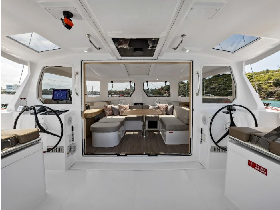
Seawind 1170 -56.jpg

The Seawind 1170 is designed for both performance and comfort, making it suitable for long range liveaboard blue-water cruising as well as for couples looking for an easily manageable catamaran for weekend sailing. Key features of the design include: